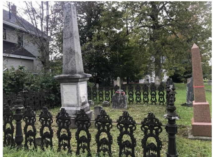
The Old Parish Burying Ground

I belong to The Hunter Clan UK as well as The Hunter Clan in Canada. I need to actually go and research the Hunters. I was at the castle once in 2011 but not quite ready to research. And I am pretty certain that were I willing to pay, the Hunter Clan would research my line. They have online meetings one of which I attended.