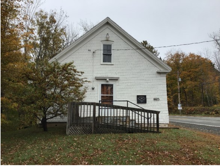
Ardoise Union Church founded 1830 in Ardoise, NS