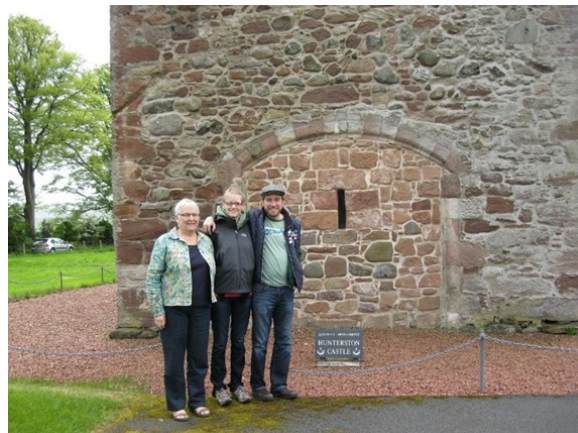
Hunterston Castle 2011