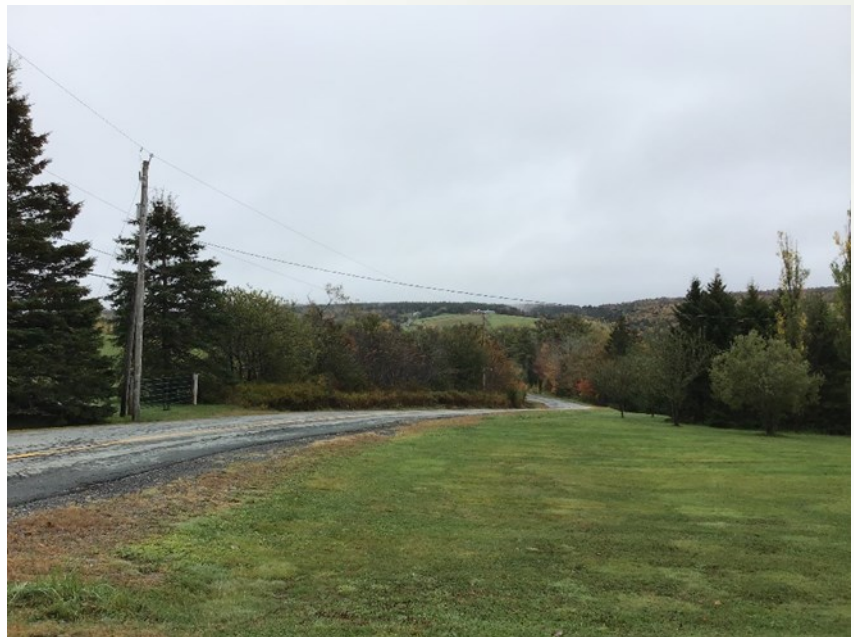
The property in Ardoise, NS granted to "my Hunters"